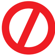
SHOES / SNEAKERS